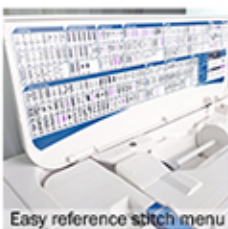
Easy reference stitch menu