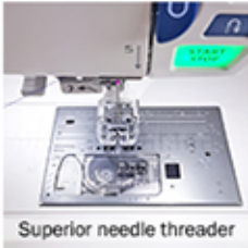
Superior needle threader