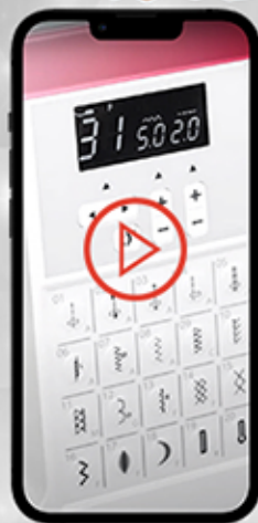
Buyer's Guide to Your First Sewing Machine