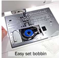
Easy set bobbin