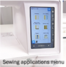
Sewing applications menu