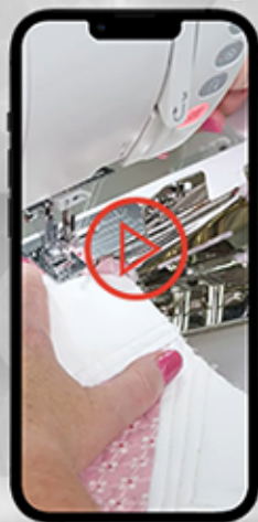
Quilt Binder Set