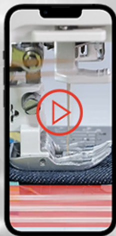
Premium Skyline Series