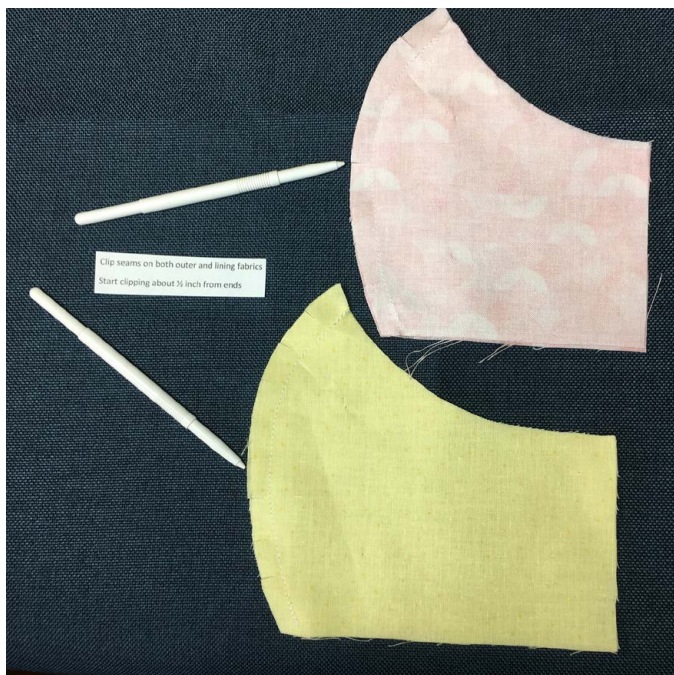
3. Sew a \frac{1}{4} - \frac{1}{2} inch seam along the center curved seam as indicated in above image. Then clip both seams to about \frac{1}{2} inch from each end.