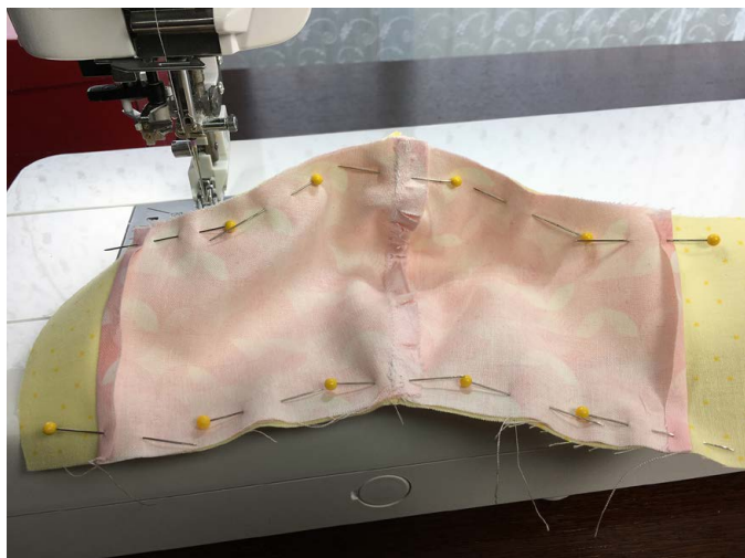
6. Pin outer fabric and lining right sides together along top and bottom edges.