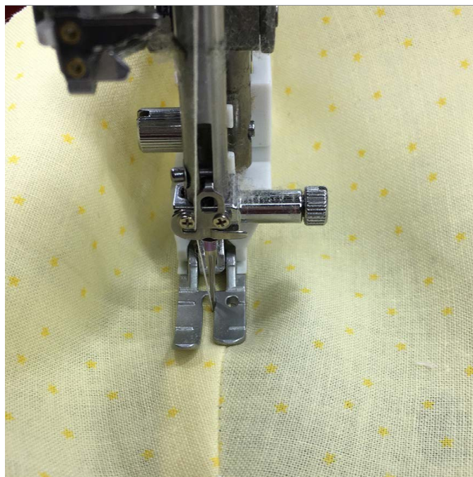
5. Top stitch the seam flat on both outer fabric and lining for a professional finish.