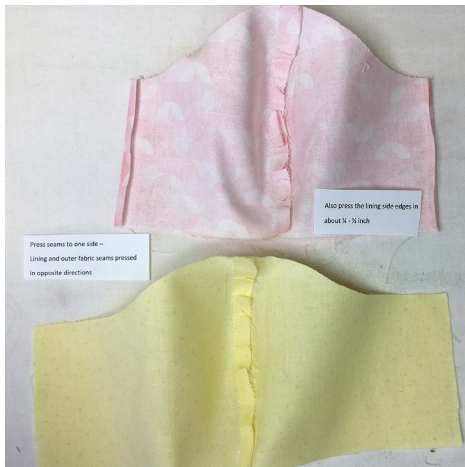
4. Press seams to one side – Lining and outer fabric seams pressed in opposite directions. Also press the lining side edges (pink fabric) in about \frac{1}{4} - \frac{1}{2} inch