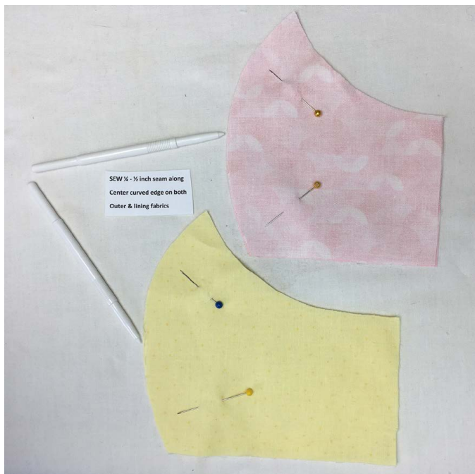
2. Pin outer pieces right sides together and do the same for the lining pieces.